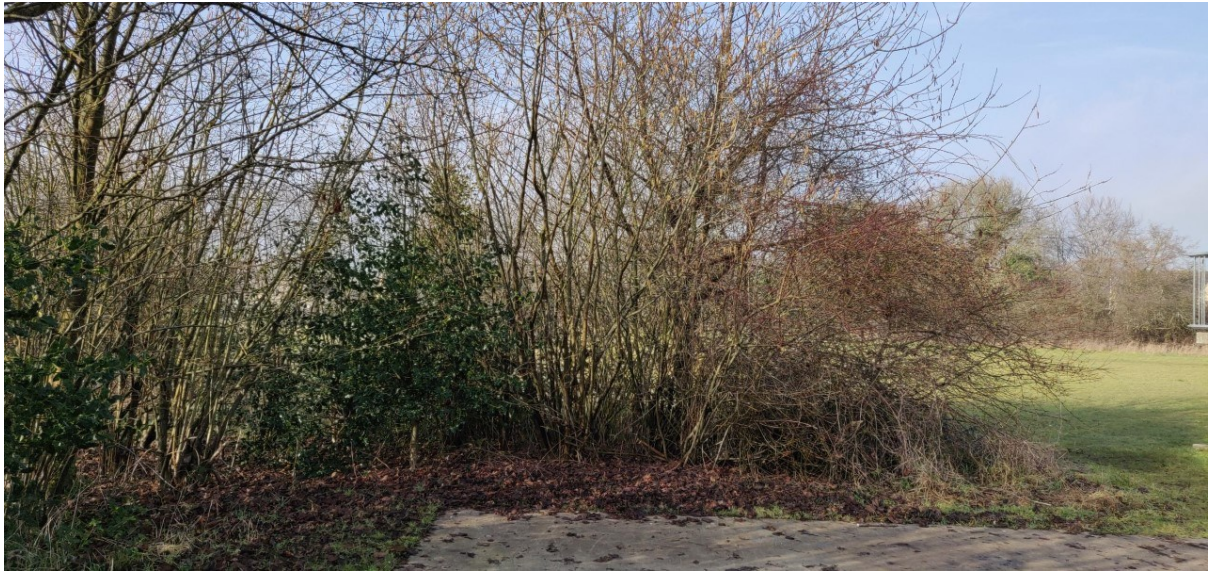
Same hedge seen from the side, you can see it is thick.