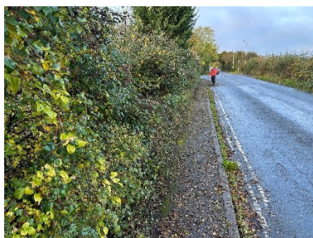
Leaf clearing on Dyers Hill

Councillors are also holding leaf clearing sessions on Saturday mornings where they identify a specific area of Charlbury each time. Please keep an eye out for the sessions on charlbury.info and social media as we would welcome your help.