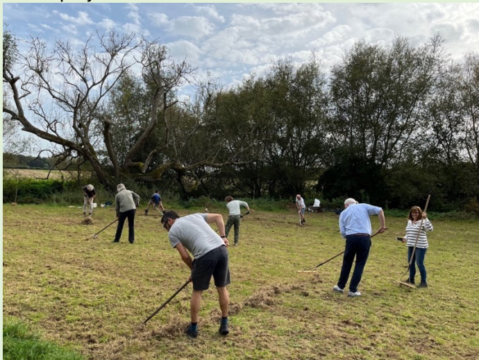
Volunteers in action on the Mill Field

The Mill Field Meadow restoration project continues. It has just been cut (mid-October) and the next stage is sowing more yellow rattle seed to suppress the growth of grasses to enable wildflowers to be sown and flourish (thus improving biodiversity). Thanks to Sustainable Charlbury for their funding of this project.